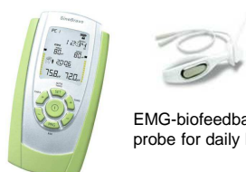
EMG-biofeedback and vaginal probe for daily home strength training

In group 2, women received an EMG-Biofeedback device (Sine Bravo, MTR, Germany) with a vaginal probe (Periform). They were instructed to perform a strength training program by a specialized physiotherapist and at home. They were also seen three times.